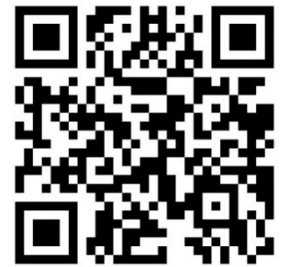
Scan Code for Video Commentary